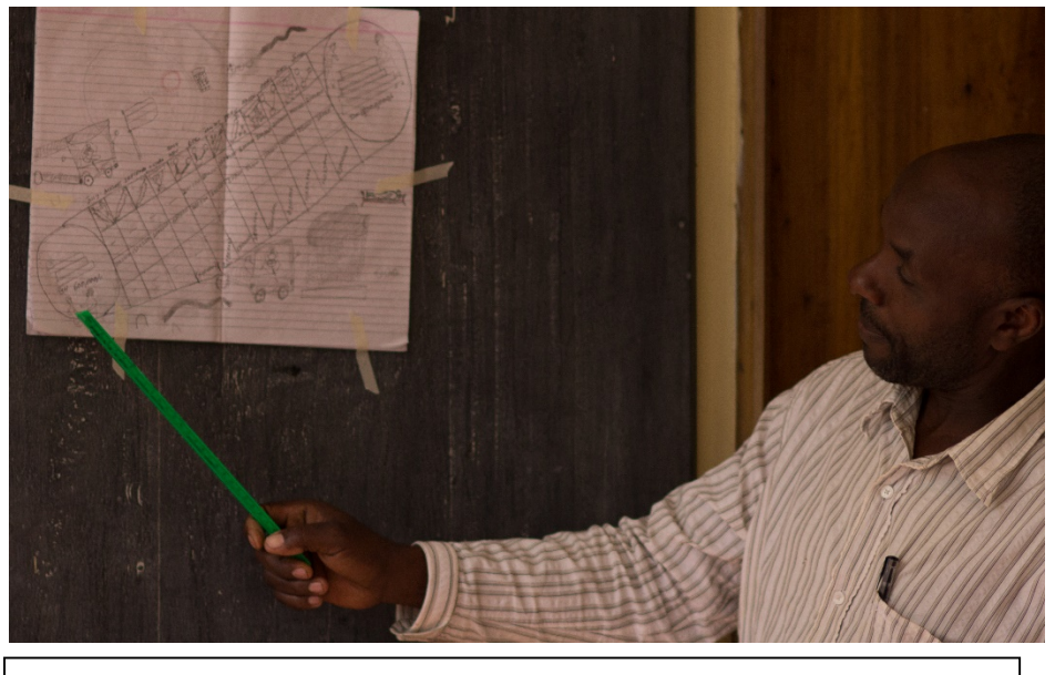
Coffee Calendar Vision Journey, Vuasu Cooperative, Same, Tanzania.

The GALS Coffee Tool 1 the Increasing Income Challenge Action Tree looked at challenges, solutions and action commitments that can increase incomes from coffee. Tool 2 household coffee business tree was a one-time snapshot of the business and how other livelihoods do or could complement this. The coffee calendar vision journey now plots work input, incomes, costs and profits for coffee over time of one year. This enables adjustments to planning to take account of peak and slack work periods and cash flow fluctuations. Work, expenditures